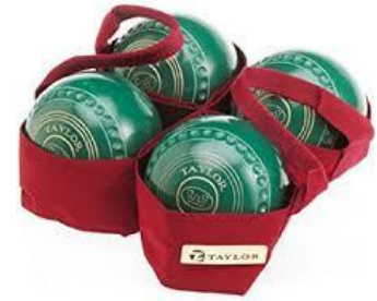
Lawn bowls carry slings $22.00