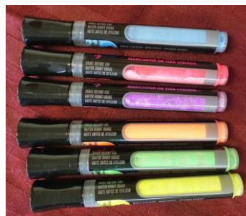
Chalk markers (various colours) $3.00

New bowls can be purchased from Shelley Sidel, Taylor Bowls agent for Vancouver Island