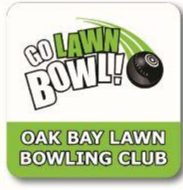
6" x 6" $7 each