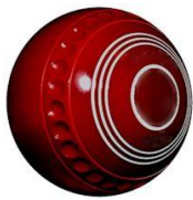
Used club bowls are occasionally available for sale.

New bowls can be purchased from Shelley Sidel, Taylor Bowls agent for Vancouver Island