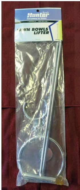
Bowl lifter $35.00