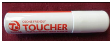
Toucher spray chalk $10.00