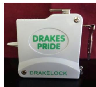
Tape measures (various) $47.00 to $50.00+