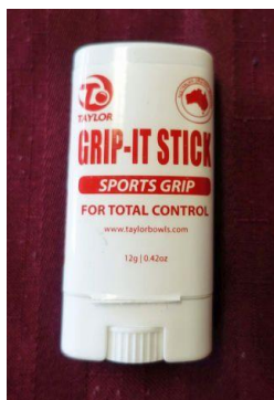
Grip-it-stick (organic grip) $18.00