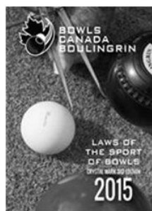
Laws of the Sport of Bowls, Crystal Mark, 3rd Edition, 2015 $8.00