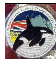
Pins Club, Bowls BC and 2017 National Championships $5.00