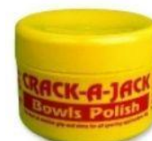
Crack-a-Jack (bowls polish and grip) $8.00