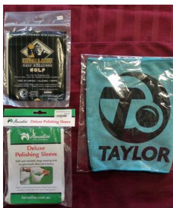
Bowl buffing cloths (various) $10 to $20